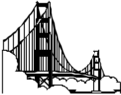
Going under the Agate Pass bridge isn't quite like this, but we can dream.