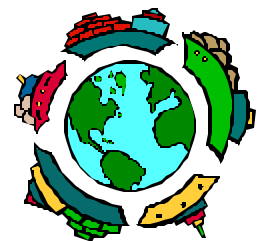
We may not do world cruises, but we do get around!

You Might Want to Check Out Our Web Site At www.capsfleet1.com