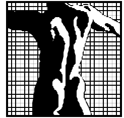
Imagine this body clad in a lovely jacket complete with CAPS logo. On the other hand, imagine this body on a CAPS member.