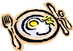
Over Easy was definitely more than an order for eggs!

We cruise, we snooze, we schmooze, and drink booze. Is that all?